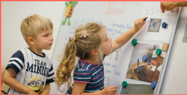
Dolli Einstein Haus in Pinneberg is run on a democratic basis, with votes on everything from food to nappy changes

At the Dolli Einstein Haus, constitutional crises are usually solved before breakfast. When one delegate's motion in favour of rice pudding with cherry compote was roundly defeated the delegates were left facing a hung vote over the choice of french toast or pancake with apple puree. Another council member then demanded sausages with spaghetti. But a second-round runoff broke the deadlock: 12:4 in favour of pancakes, an absolute majority that everyone could live with.